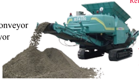
Type II 2-way split